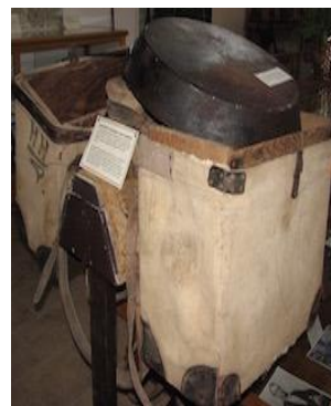
Hart family mule packing equipment used to pack into the back country.