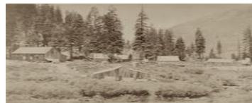
Mineral King in the 1890s

My first trip to Mineral King was in 1874. I arrived there July 4, and have been there every summer since, with the exception of two.