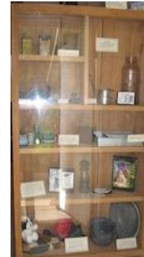
Atwell Mill wood cabinet with MK cabin artifacts.