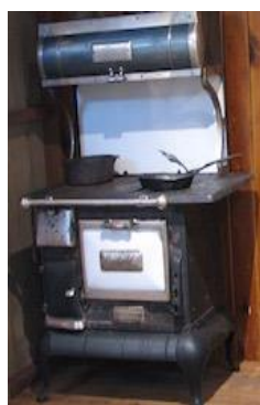
Nielsen family wood stove used in Mineral King 1920s to 2015.